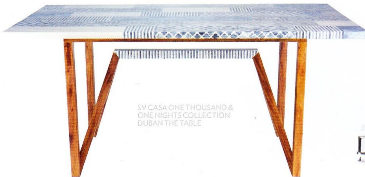
SV CASA ONE THOUSAND & ONE NIGHT'S COLLECTION DUBAN THE TABLE