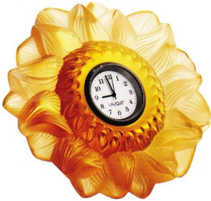
LALIQUE AMBER CLOCK